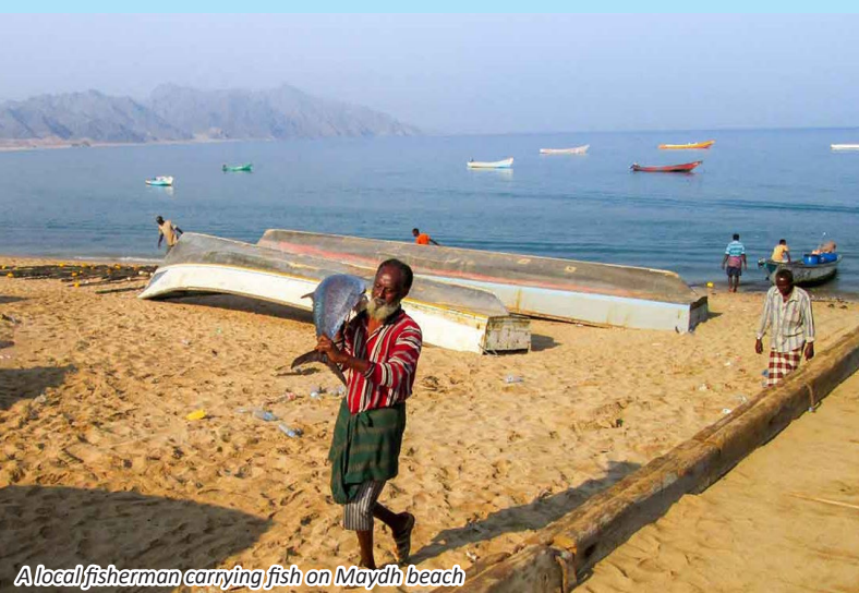
A local fisherman carrying fish on Maydh beach