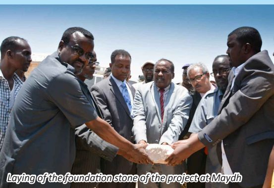
Laying of the foundation stone of the project at Maydh