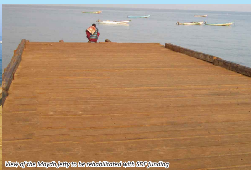
View of the Maydh jetty to be rehabilitated with SDF funding

Who Ministry of Fisheries and Marine Resources