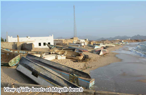
View of idle boats at Maydh beach