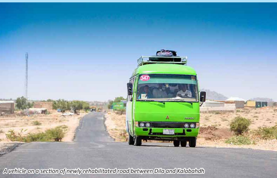
A vehicle on a section of newly rehabilitated road between Dila and Kalabaydh

What Rehabilitation of a 19.2 km section of the main Hargeisa Borama road, between Kalabaydh and Dila. Approximately 300,000 of the Somaliland population will benefit directly from the rehabilitated road.