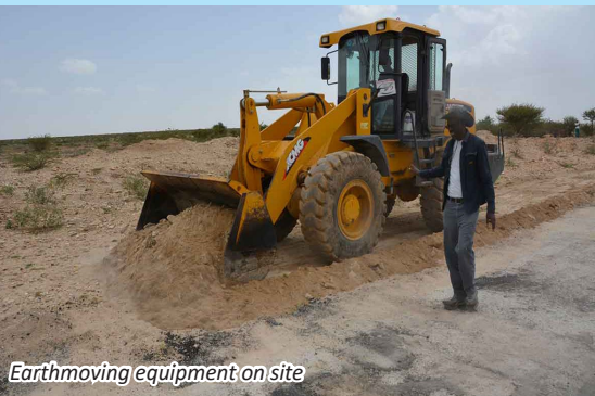
Earthmoving equipment on site

Who Road Development Agency When 2014 – 2017