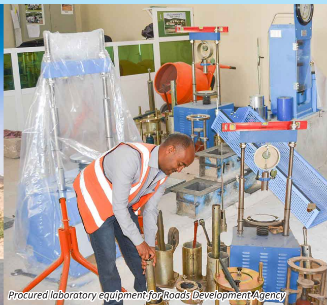
Procured laboratory equipment for Roads Development Agency