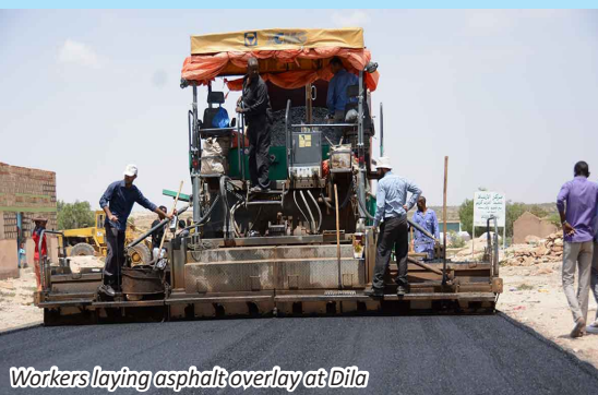
Workers laying asphalt overlay at Dila

Outcome Reduced travel times to the major towns connected by the project roads, lower vehicle operating costs with minimized motor accidents and improvement in government delivery services. Spur economic growth/activities in the areas traversed by the roads project thereby reducing the poverty levels of the roadside local communities.